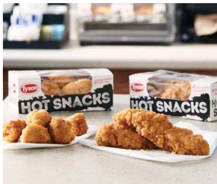
Premium Homestyle Breaded Boneless Wings